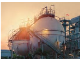
Industrial Gas / Medical Gas