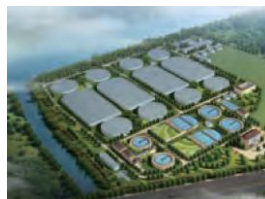
Water & Sewage