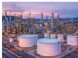
Petrochemical Plant / Chemical Plant